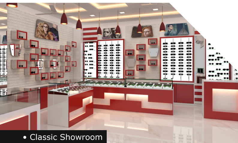
• Classic Showroom